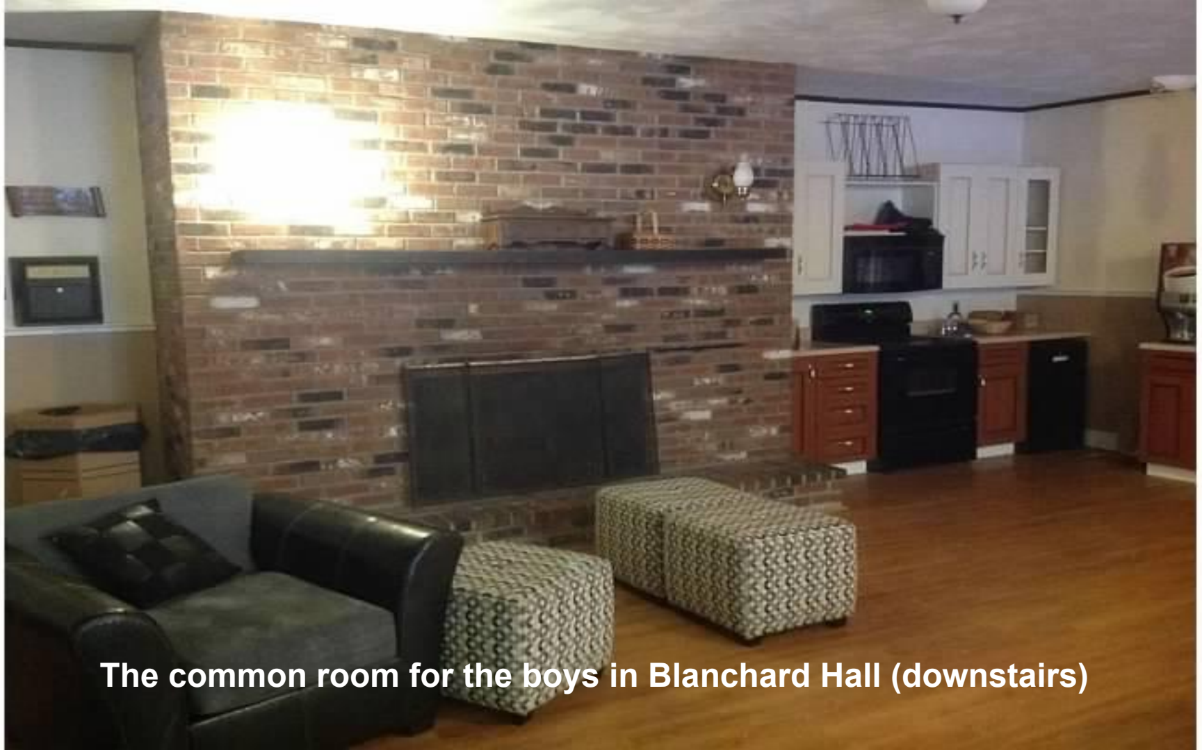
The common room for the boys in Blanchard Hall (downstairs)