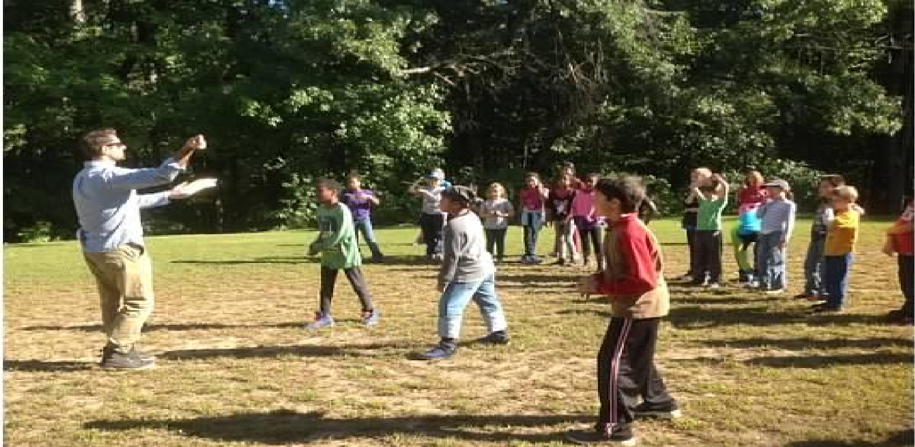
Here are a few more pictures of fun times at Nature's Classroom.