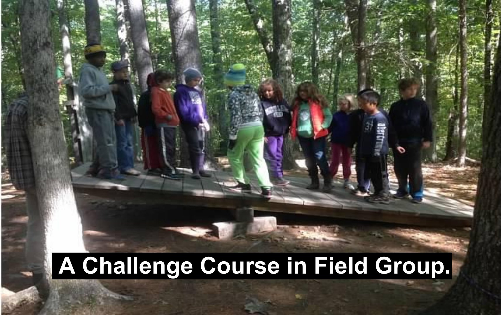
A Challenge Course in Field Group.